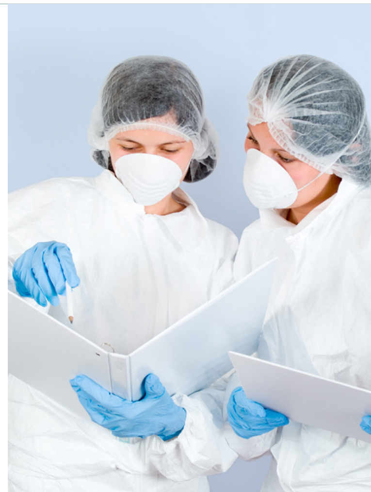
RESOLUTION ON ADMINISTRATIVE PROCEDURES FOR ISSUANCE OF GOOD MANUFACTURING PRACTICES CERTIFICATE AND GOOD DISTRIBUTION AND/OR STORAGE PRACTICES CERTIFICATE (RESOLUTION RDC ANVISA NO. 217 OF FEBRUARY 20, 2018). (PHOTO: ADOBE STOCK).

Provides for the guidelines for conditional approval of pharmaceutical post-registration change applications, and makes other provisions. ■